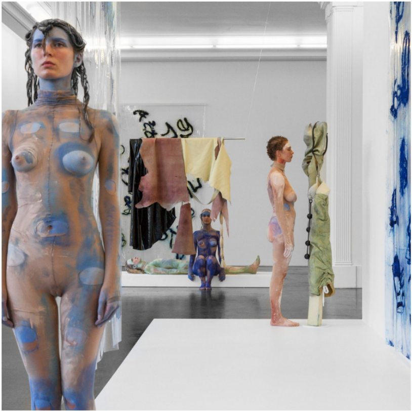
Performance view of "Donna Huanca: Surrogate Painteen," 2016.

Earlier this month, Donna Huanca's new show "Surrogate Painteen" opened at Peres Projects in Berlin. The gallery is populated by delicate sculptures, fields of gestural swaths of skin and paint, and nude performers coated from head to toe in rich color.