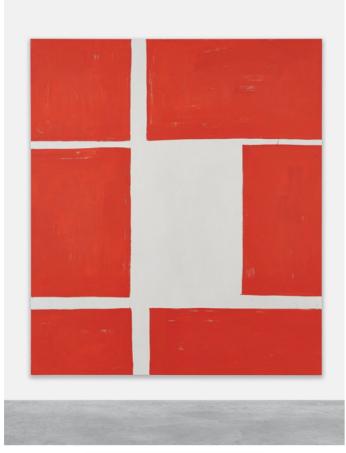
Beth Letain, Either Other, 2018, oil on canvas, 87 x 75 inches.