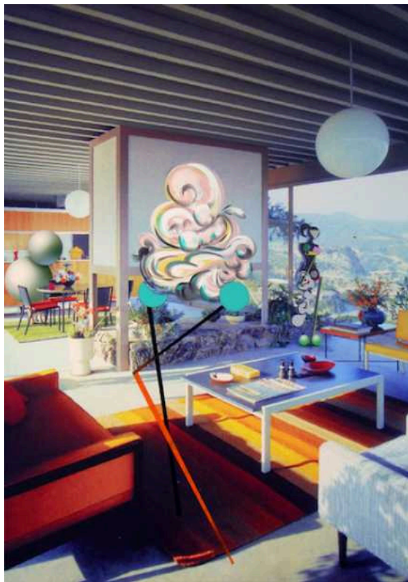
Ad Minoliti CSH_21 , 2015 Acrylic on printed canvas 52 x 39,5 in / 130 x 100 cm