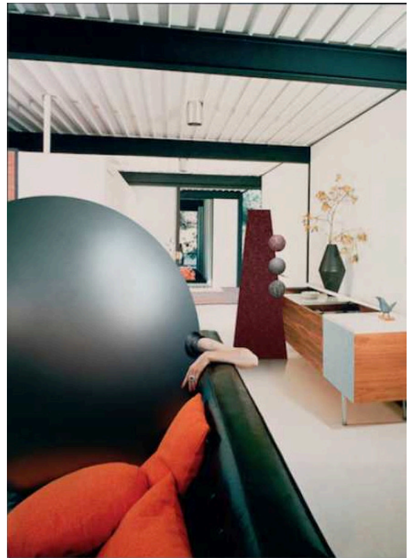
Ad Minoliti CSH_8 , 2015 Acrylic on printed canvas 55 x 39,5 in / 140 x 100 cm