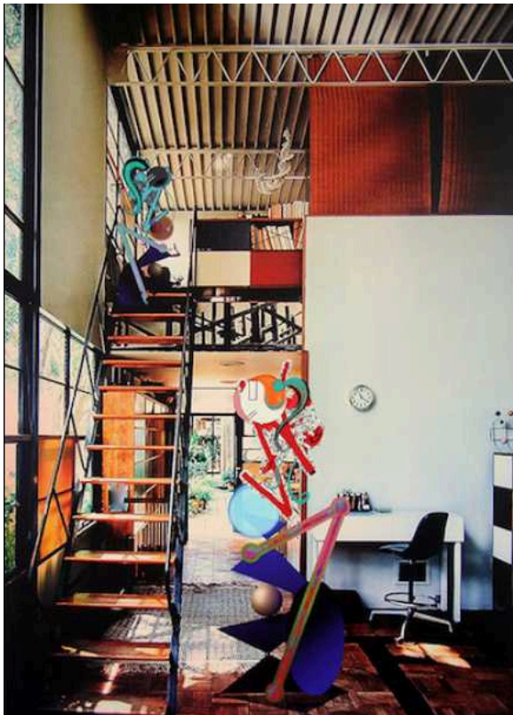
Ad Minoliti CSH_9 , 2015 Acrylic on printed canvas 55 x 39,5 in / 140 x 100 cm

A cyborg is a restored organism, having superior ability due to the incorporation of certain artificial technological components. The “cyborg paintings” endeavour to decode our notion of hand creation and machine creation. As an artist, Minoliti has always liked to dabble in the pre-concepts of appearance, using gender theory to pictorially contest what each gesture actually represents. She feels the need to get into that deep chasm and reconstruct the imaginary land into different view-points that arise from the male gaze. What interests her is the dismantling of conceptual and technical borders that are based on rigid heteronormative context, where western culture has divided beings of the world into two categories. This is how Minoliti began her exploration into the ideals of gender, sex and how they are pictorially depicted from a misogynistic and regressive viewpoint.