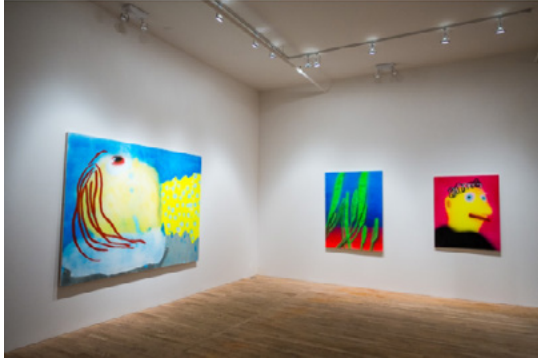
Installation view, Austin Lee at Postmasters Gallery