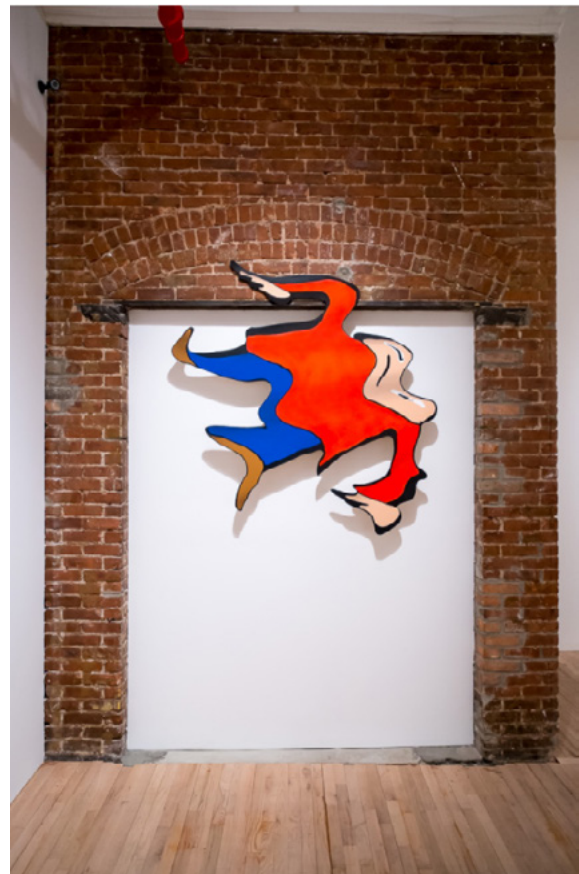
Austin Lee, “Displaced” (2013)