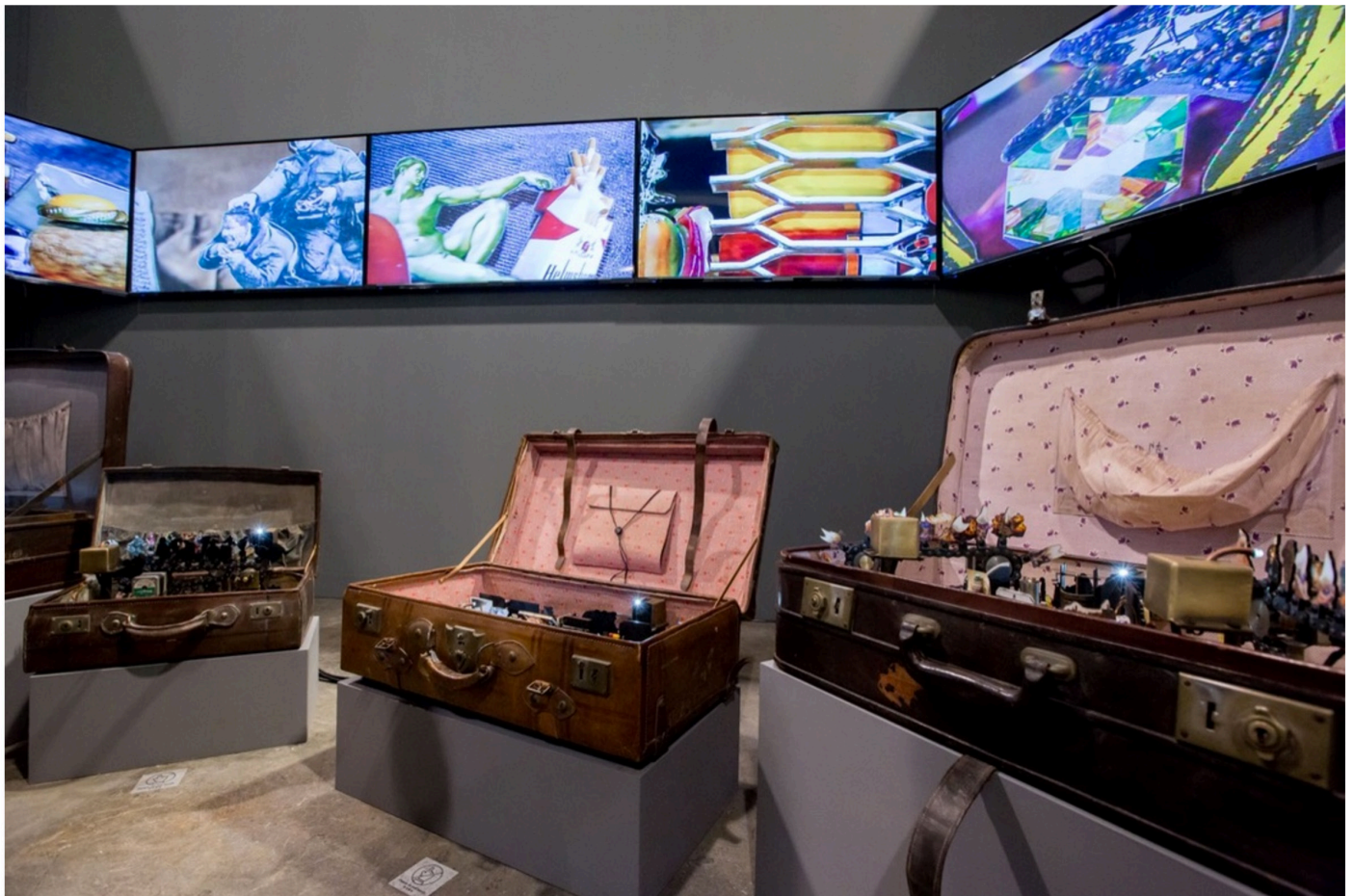
Installation view of A+ Contemporary's booth at Art Basel in Hong Kong, 2017.

In the Encounters sector, Beijing-based Ink Studio presents monumental scrolls by Chinese artist Bingyi, which were created en plein air on Chinese mountainsides. At 22 meters long and 2.8 meters wide, only two of the six works in the oversized series could be shown at Art Basel in Hong Kong, both of which have already been sold. The gallery is also showing work by Zheng Chongbin in Insights. Zheng mounts large-scale abstract ink and acrylic paintings onto layered pieces of corrugated aluminum to create angled, geometric shapes that starkly contrast their expressive strokes.