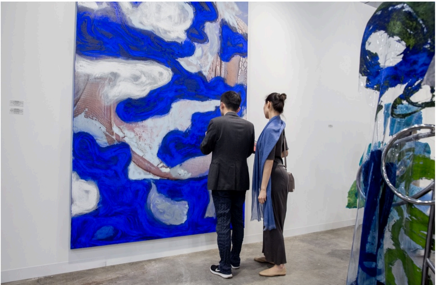
Installation view of Peres Projects's booth at Art Basel in Hong Kong, 2017.