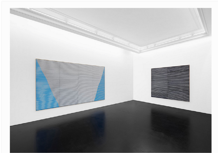
Brent Wadden, zerodayolds, Installation View, Photo: Matthias Kolb, Courtesy Peres Projects-Berlin