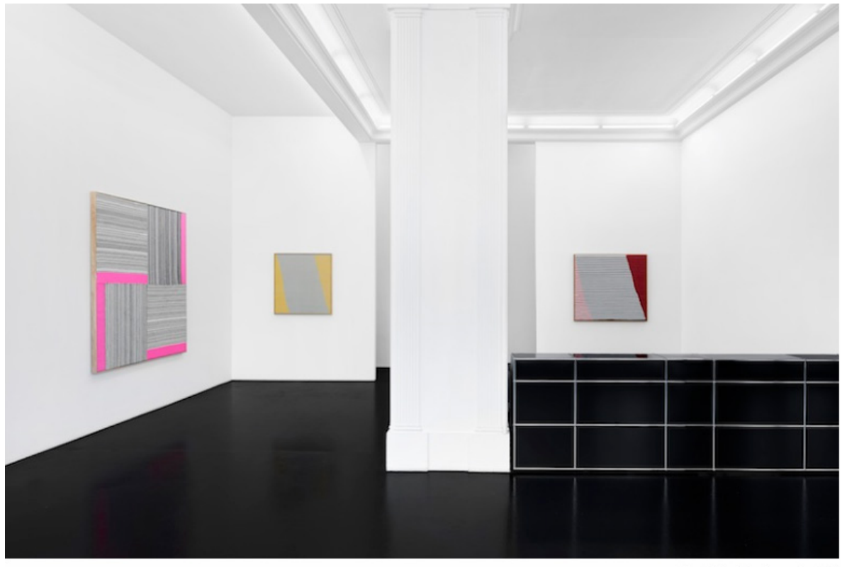
Brent Wadden: 'zerodayolds'

Installation view, Peres Projects, Berlin // Courtesy Peres Projects, Berlin, Photo by Matthias Kolb