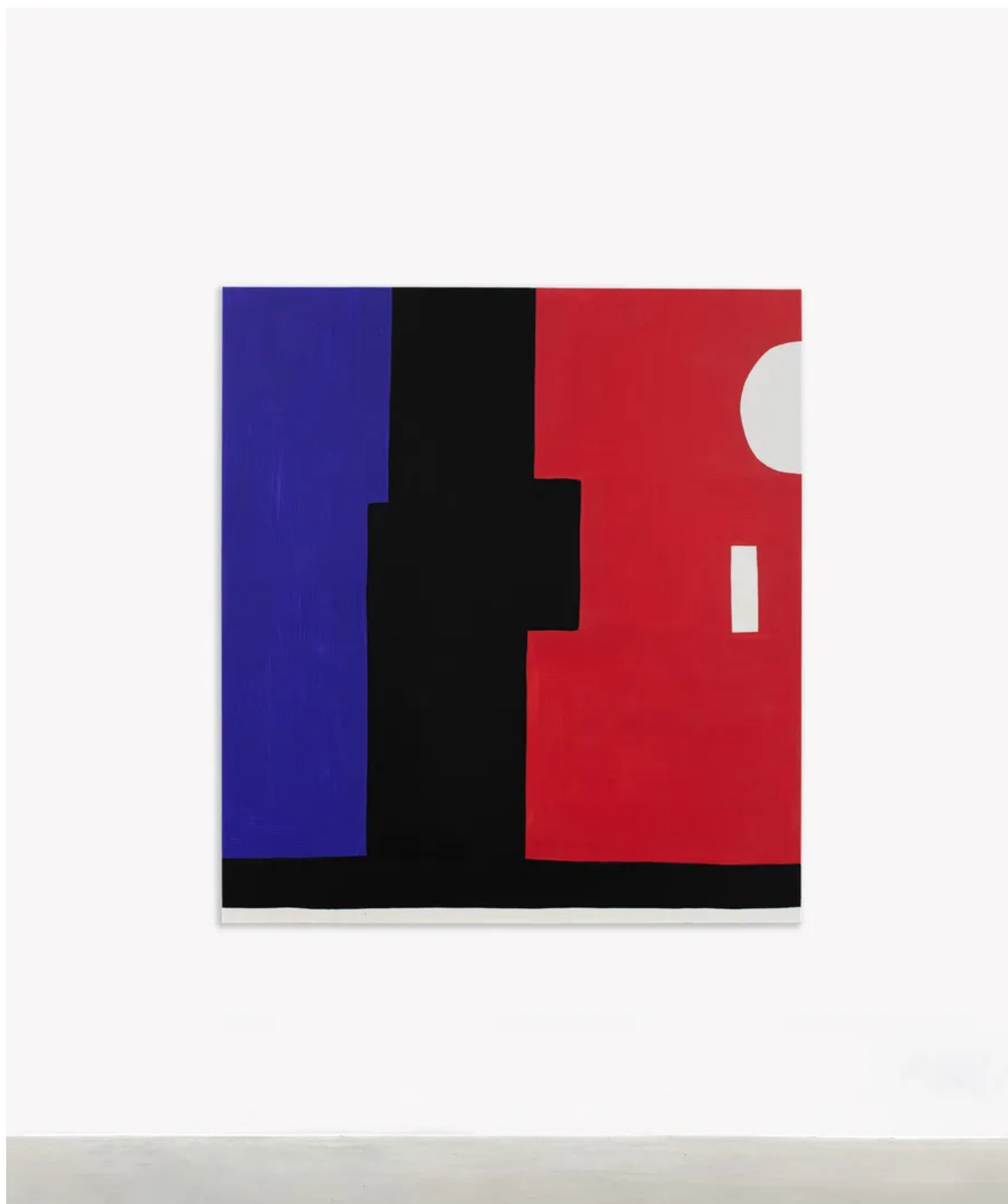
Beth Letain Long and Short, 2024 Painting – Acrylic and oil on canvas 170 x 155 cm (67 x 61 in) (BL18001)