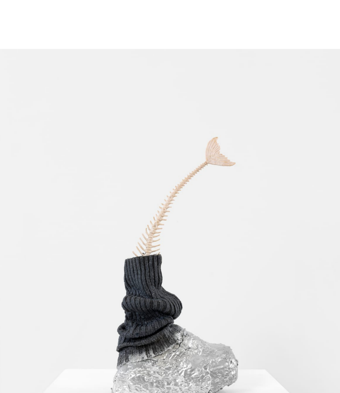
Left: Shuang Li, Can you stake me before the sun goes down, 2023. Courtesy of the artist and Peres Projects. Right: Shuang Li, As Your Body Remains, 2023. Courtesy of the artist and Peres Projects.

Surrounding the fountain, 'cutesy fan-girl' paraphernalia is embedded into transparent resin wall reliefs evoking milidewy, oversize phone screens. 'They are grotesque and mutating,' she says of the objects, which almost bleed out of the resin. Also on view are squashed photographs of the Lord of the Flies performance printed onto fabric trapped between plexiglass panels – images that confront our growing screen reliance and notions of control and freedom. 'Technology is a seemingly smooth surface or process, but actually there are so many wrinkles,' she says. 'My practice is similar to the damaged dakou CDs dumped in Asia as digital waste before somebody realized the punctured holes would hurt only one song, and they started reselling them...It's about finding wrinkles and working through them.'