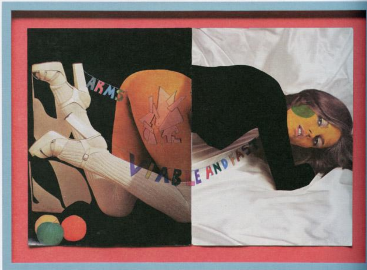
"Arms Viable and Fast (Crawl Girl 01)," 2008. Drawing: marker and ink on paper, 14.6" x 20.5" framed.