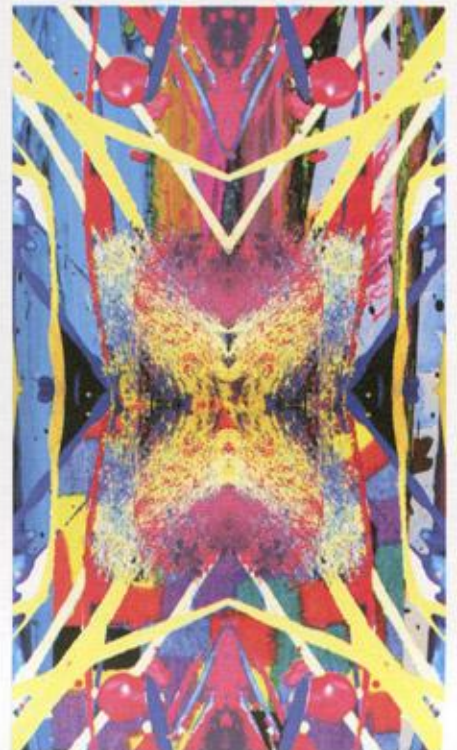
Below: "Vertigo Anxiety," 2008, Digital print on canvas. 142 x 262.3 cm (55.9 x 103.3 inches)