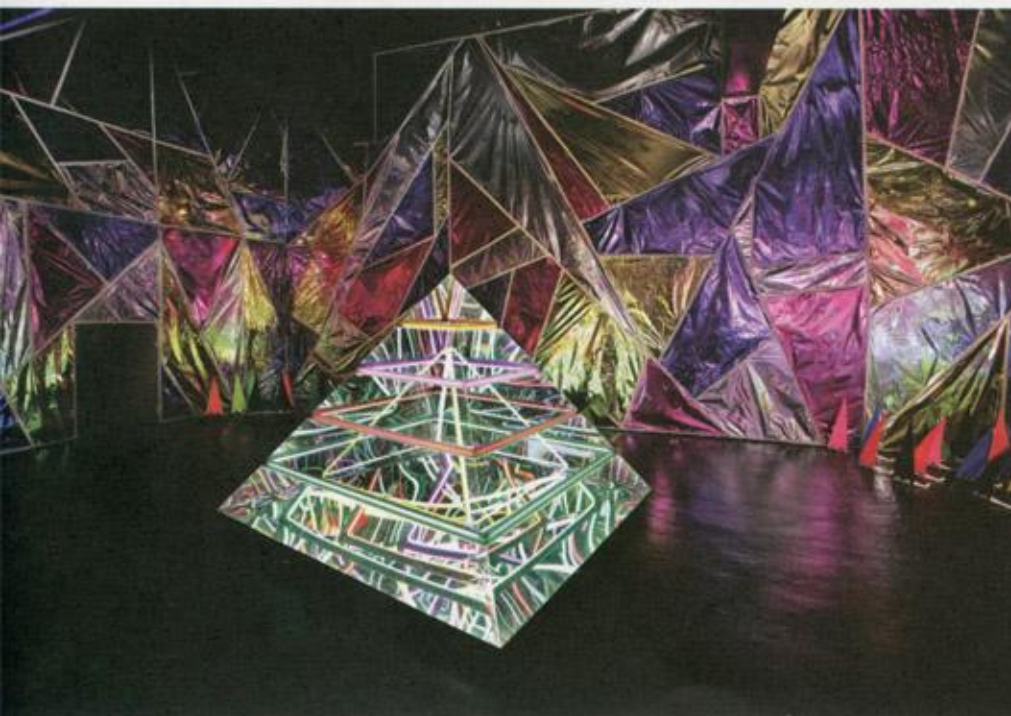
Below: VERTIGO NOVEL NOTHING STRANGE PART 2 , 2008. Sculpture: neon, one-way mirror, plexiglas, controller, motor, and aluminium. Approximately 72" x 72" x 72".