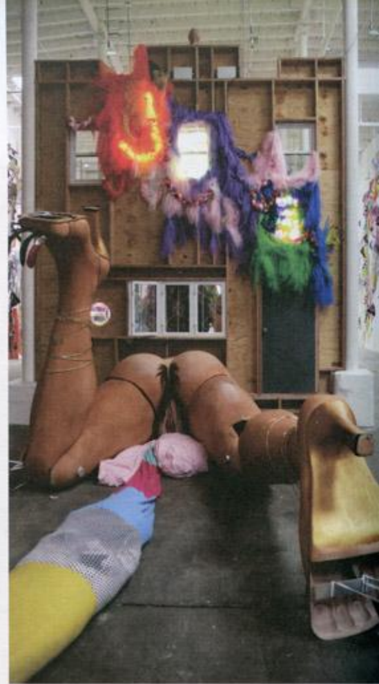
Clockwise from top: Absolutely Venomous Accurately Fallacious (Naturally Delicious) , 2008. Installation view, Deitch Projects, Long Island City, May 10-August 10, 2008.