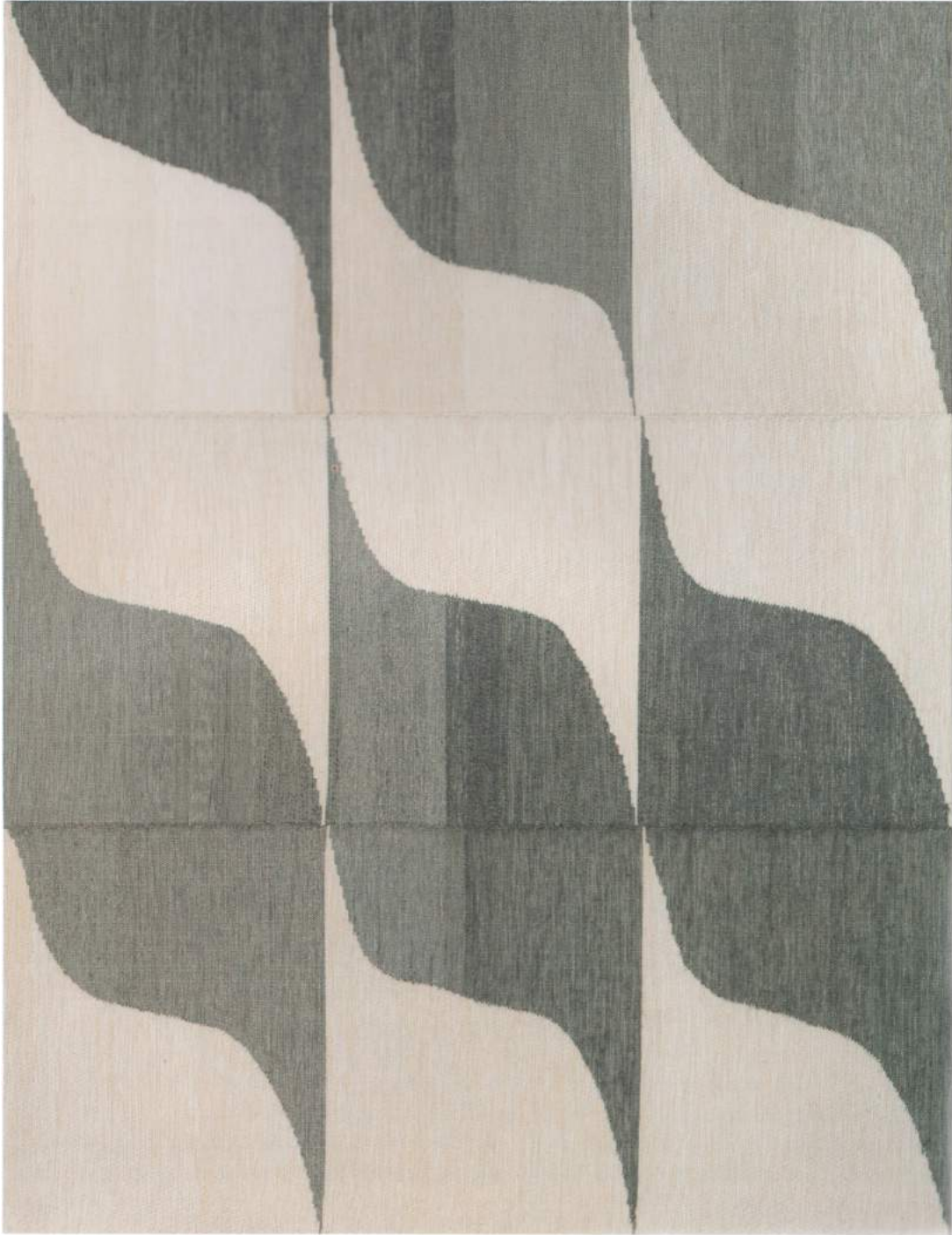
3 Grey Swoops, 2015