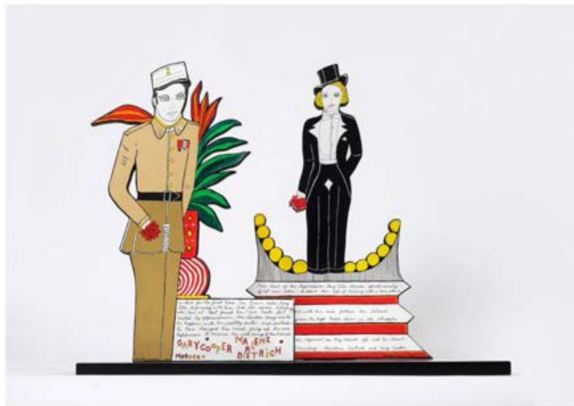
Previous page: Lists IV: A Much More Detailed Than Requested Reconstruction (1968)