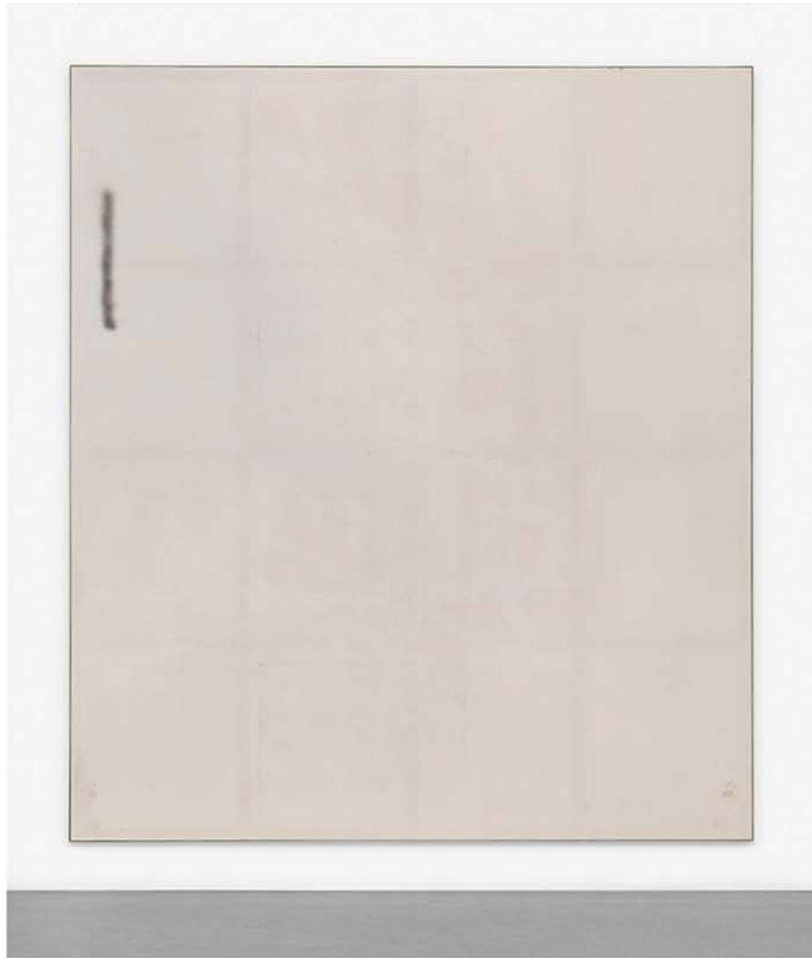
F (Musik ist Scheisse), 2014