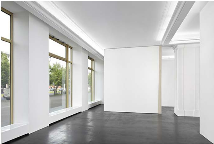
David Ostrowski, "Emotional Paintings" installation views at Peres Projects, Berlin, 2014

The exhibition debuted on the occasion of the 10th Berlin Gallery Weekend which is supported by BMW Berlin and Audemars Piguet – Le Brassus.