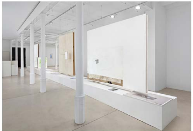
Bei mir geht es in den Keller hoch, Blueproject Foundation, Barcelona, 2017

Music plays an important role in my work. It's what motivates and distracts me. A day at the studio can be absolutely shitty. Music is a constant. At the same time, it's a love-hate relationship because from early on I had to come to terms with the fact that painting does not even remotely evoke emotions as strong, fast, and easy as music does. It sounds cheesy, which it should, but music always comes first for me. I would be happy if my works were regarded as having musical qualities. I also like to watch TV.