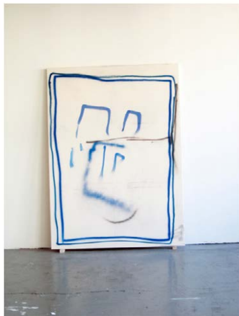
F (Oben Putz unten Schmutz), 2012, lacquer on canvas, 220 x 160 cm, Courtesy the artist

Without humor, I couldn't stand my own works. There's almost no piece that couldn't be meant ironically but also dead serious at the same time. I don't go to my studio exclusively for fun, but to paint the best possible piece, which demands more and more strength with every new attempt. The titles of my pictures are, for the most part, autobiographically tinged and always relate to the individual piece in a very direct manner. I also like to give good titles to lesser artworks, just to keep things balanced. In general, I can enjoy any type of comedy, it really comes down to the respective comedian and how he or she delivers their punchlines.