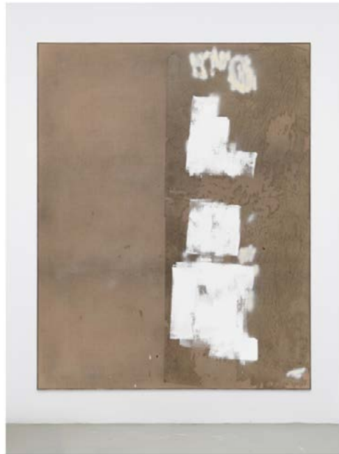
F (Yes or let's say no), 2013, acrylic, lacquer and paper on burlap, wood, 241 x 191 cm, Courtesy the artist

I work with a narrow color palette. Oftentimes it consists of colors I did not particularly like so far. It's the attempt to incorporate certain colors to a degree that I can live with them. By now I even like blue. White paint evokes innocence and purity. White is also the most neutral. And I'm still on bad terms with red.