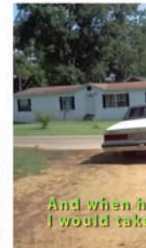
Leo Gabin A Crackup at the Race Riots , 2013 Peres Projects