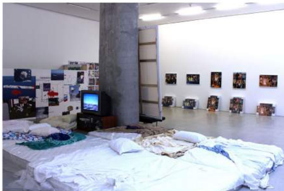
Installation view of "The Future Is Ow" at Marlborough Chelsea, New York.