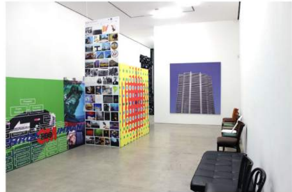
Installation view of "The Future Is Ow" at Marlborough Chelsea, New York.