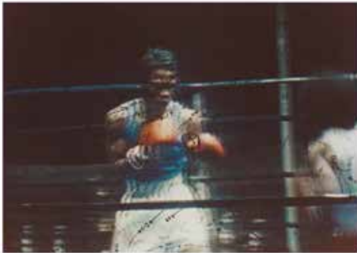
Howardena Pindell Video Drawings: Boxing 1976 Garth Greenan Gallery, New York