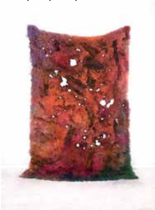
ANNA BETBEZE Sludge 2015