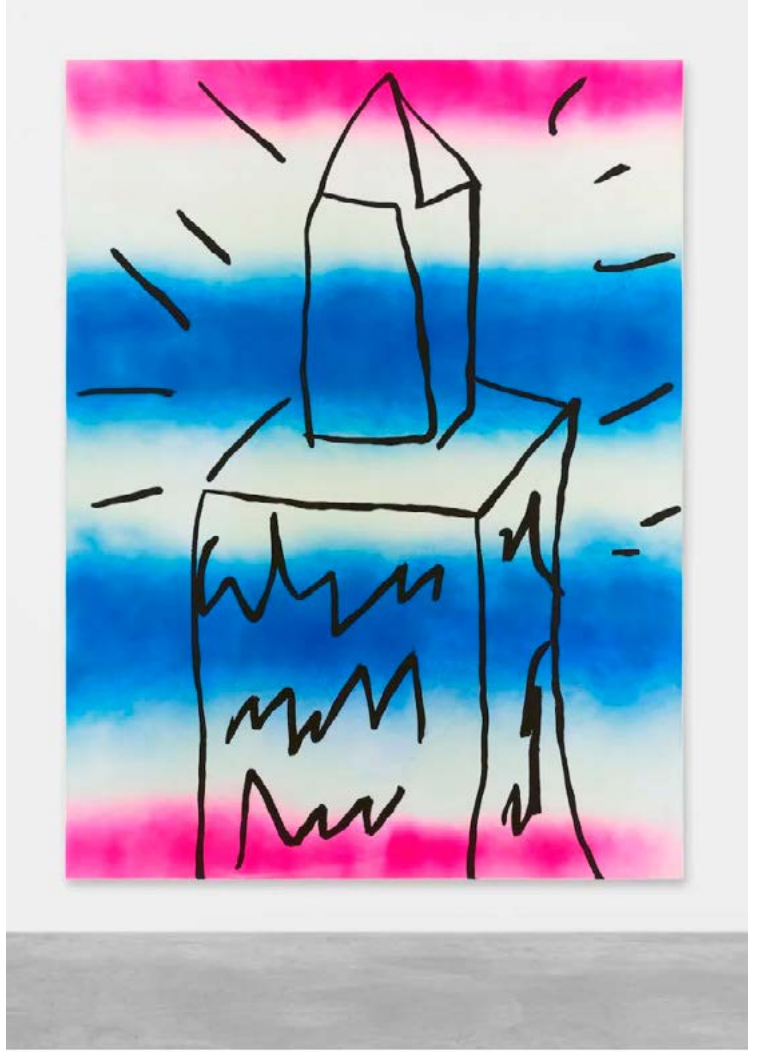
Austin Lee's Empire (2018).