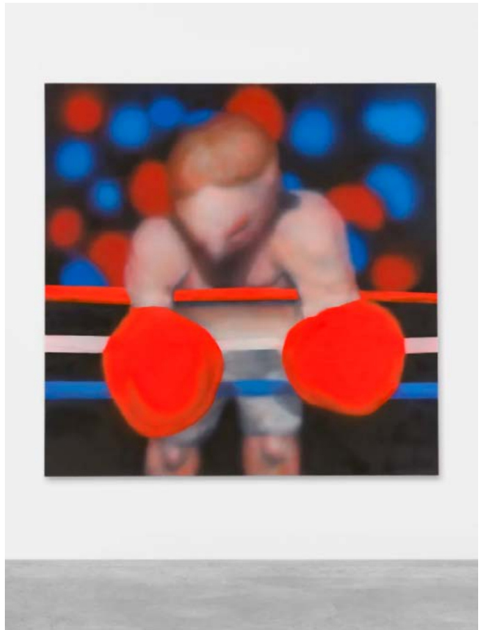
Austin Lee's Lean (2018).