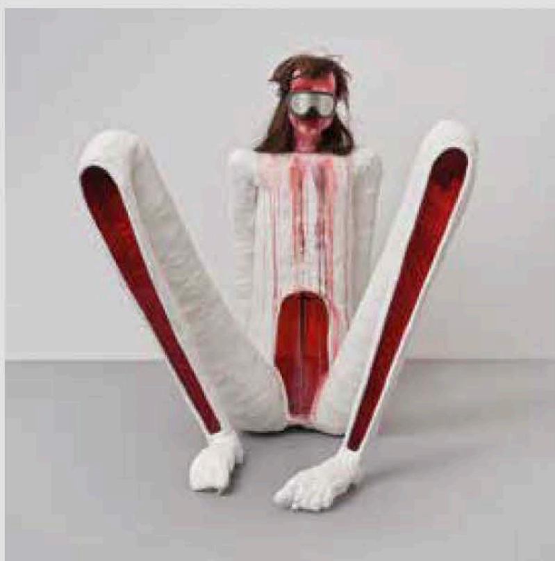
Rebecca Ackroyd, RAY! , 2018, Sculpture - Steel rebar, chicken wire, plaster, wax, synthetic hair, acrylic glass, steel, belts, 128 x 123 x 138.5 cm

Rebecca Ackroyd's (1987, UK) reclining figure lies in a red otherworldly light. The body is conceptualized bearing links with architecture, with the legs and the torso featuring transparent window-shaped openings. It wears goggles shielding the eyes. The scenery is undefined: the form exists in its own time and space, it could be the sea, or a futuristic setting and it remains unknown if it is welcoming or hazardous.