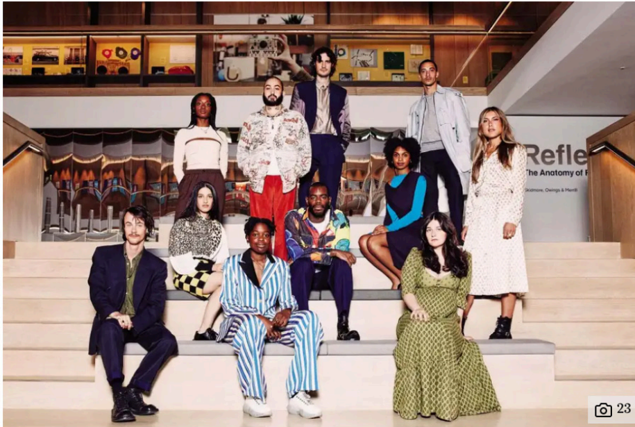
The art world's rising stars shot on location at the Design Museum, London ( Ryan Saradjola )

CLARA STRUNCK | Thursday 26 September 2019 07:00 | 0 comments